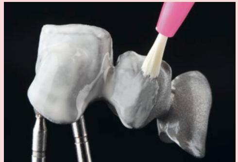
SHOFU Universal Pre-Opaque