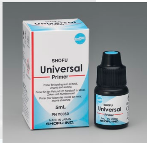
SHOFU Universal Primer Contents 5 ml, PN Y0060