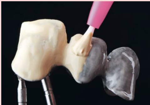
SHOFU Universal Opaque

SHOFU Universal Primer, the successor to the proven SHOFU MZ Primer Plus, is the universal solution for bonding resins to CAD/CAM metal and zirconia frameworks, thanks to its wide range of indications and quick and easy handling without any further accessories or heat treatments.