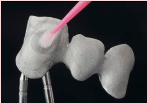
SHOFU Universal Primer