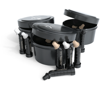
Transcend Singles 1pk 10 x 0,2 g singles