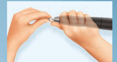
K-ERGOgrip (above): Ergonomic holding position, gentle on the wrist. No "bending" as with other handpieces (example below)